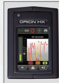
Histogram graph displays history of harmonic response and power adjustment from 10 - 60 second duration.