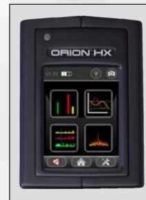
Main screen offers quick mode selection.

MODEL INFORMATION: The transmit power of the ORION 900 HX is 1.4 W EIRP and automatically searches for quiet operating frequencies between 840 and 960 MHz. It is FCC and IC compliant. The G model , with 3.2 W EIRP transmit power, is available to entities, agencies, and persons not restricted by FCC and IC. Both models are CE marked for public safety and security. Commercial CE version also available.