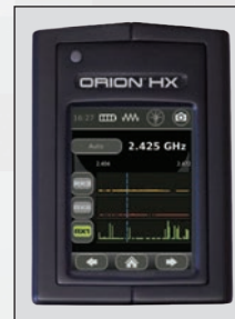
Frequency adjust screen displays Transmit, 2nd, and 3rd frequency ranges.