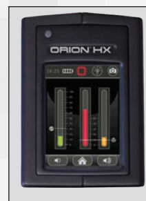
Tx and Rx graph displays power, 2nd, and 3rd harmonic levels and touch screen trip and power level adjustments.