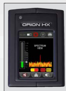
Spectrum View shows 2nd and 3rd harmonic spectrum graphs in several view options