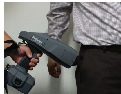
Scanning subject using non-contact, inhalation sampling.