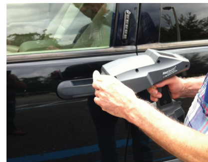
HE50 analyzing sample trap after swipe method collection.

The HE50 uses a unique ionization source with US Nuclear Regulatory Commission (NRC) Exempt Distribution status that has no end-user radiation licensing requirements for use within the United States. International operators should check with their nuclear regulatory agency for local requirements.