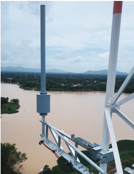
R&S®HK309 and R&S®HF902 monitoring antennas overlooking Thailand's landscape