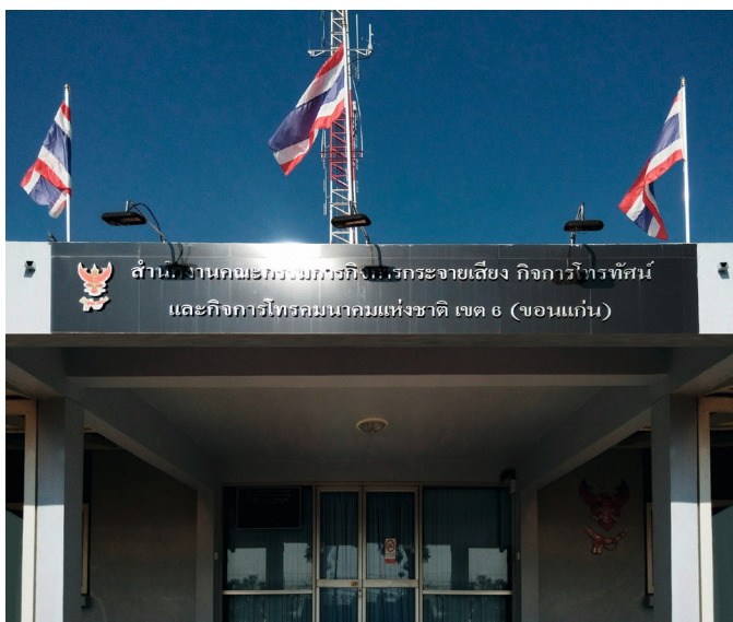
Khon Kaen monitoring station

software provides operators with automatic measurements. These measurements start and stop as needed, recording data and audio signals and triggering warnings when measured values exceed reference levels. This allows the authority to verify compliance with the licensed parameters and guidelines for transmitter systems. Any violation or radio interference source can be detected, identified and followed up.