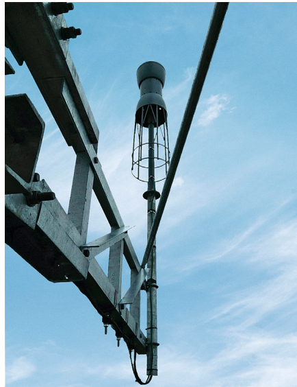
The R&S®HK033 omnidirectional monitoring antenna